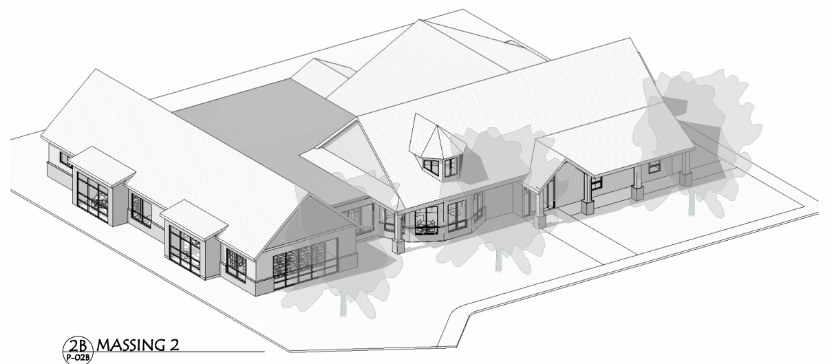
2B MASSING 2 P-028